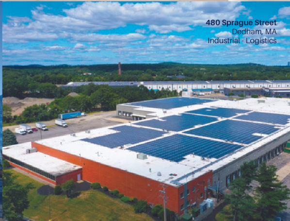
480 Sprague Street Dedham, MA Industrial - Logistics