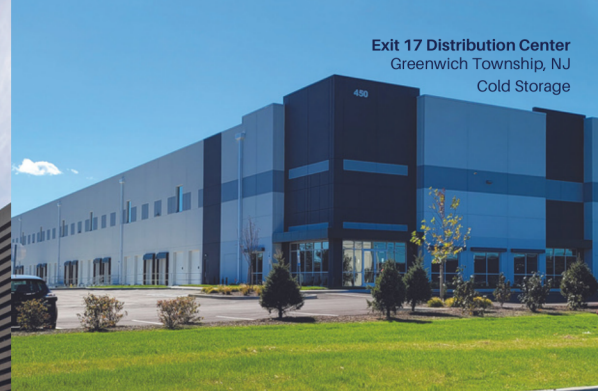
Exit 17 Distribution Center Greenwich Township, NJ Cold Storage