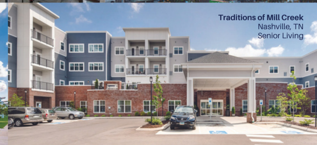
Traditions of Mill Creek Nashville, TN Senior Living