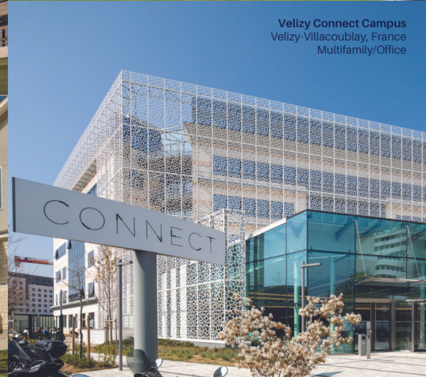
Velizy Connect Campus Velizy-Villacoublay, France Multifamily/Office