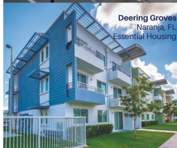
Deering Groves Naranja, FL Essential Housing