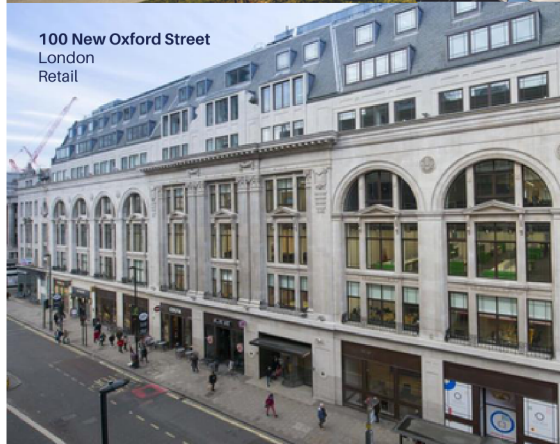
100 New Oxford Street London Retail