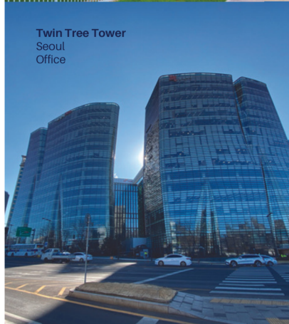
Twin Tree Tower Seoul Office