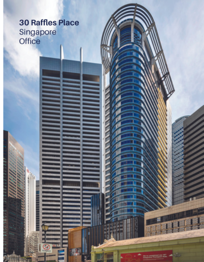
30 Raffles Place Singapore Office

The transactions on this page are presented to show recent acquisitions by the AEW Private Equity Investment Group. Although these transactions represent the types that we may pursue in the future, no representation is made that similar opportunities will be available. Investors will not receive an interest in the properties pictured.