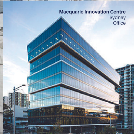
Macquarie Innovation Centre Sydney Office