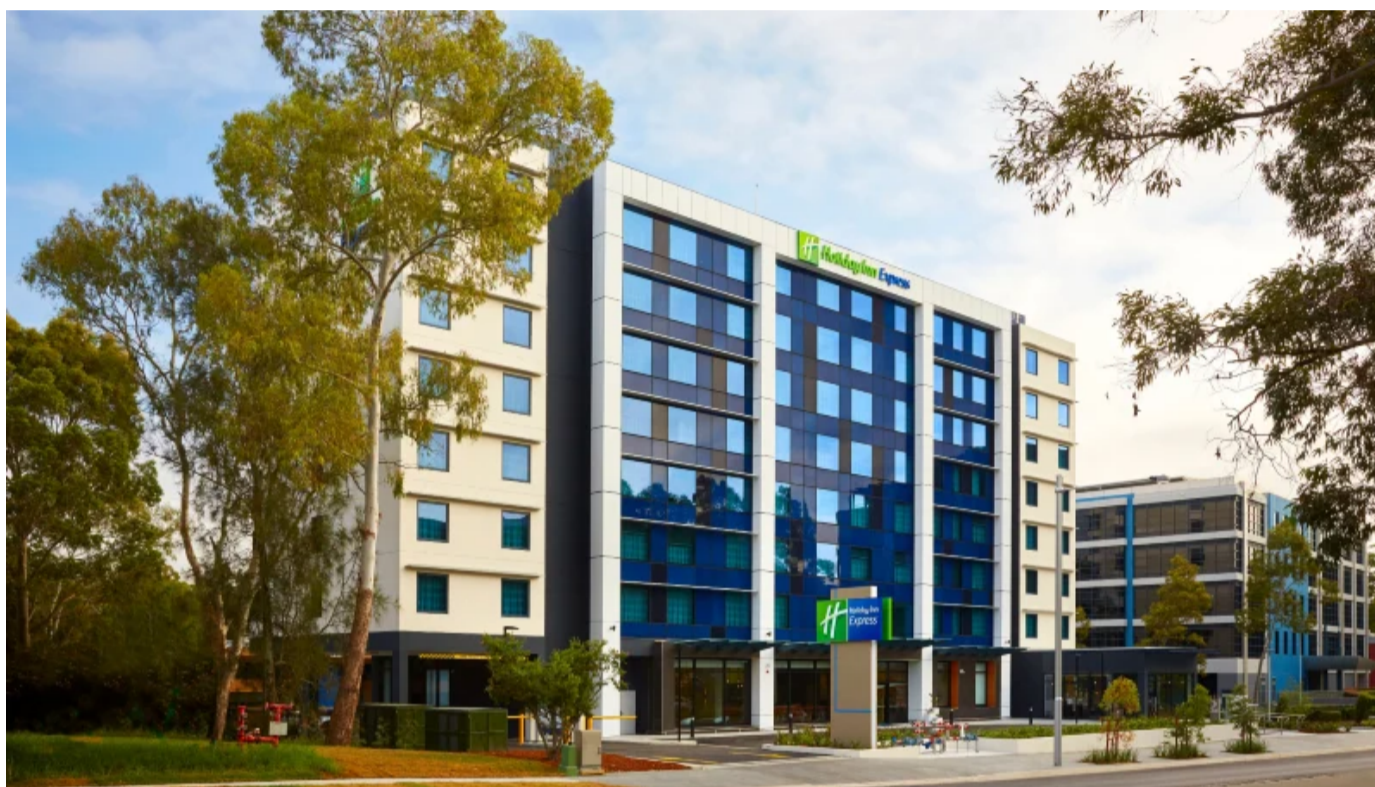
The Holiday Inn Express Macquarie Park hotel in Sydney.

Germany's Aareal Bank has lent Australia-based Pro-invest Group € 25 million for the re-financing of its Holiday Inn Express Macquarie Park hotel in Sydney under its new "Green Finance Framework".